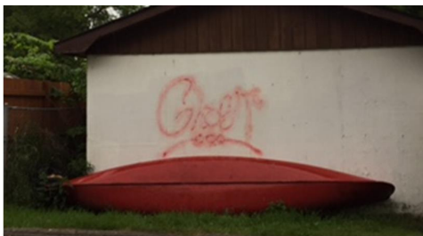
119 Lorne Ave. Before & After 2017

The program was available for 9 weeks this summer; during that time, The Green Team was able to remove 41 tags across the city. Over that time, the two-person team biked the city starting on June 12 until August 18. Some of the graffiti removed included Tupper Bridge as well as multiple tags from city signs. Overall neighbors' reactions to the program was very positive accepting this free removal service.